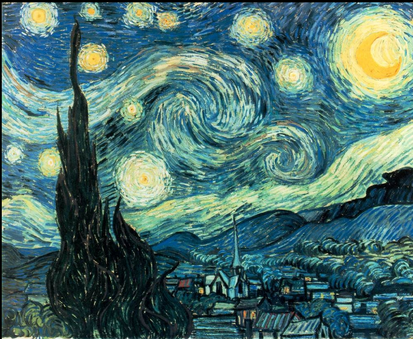
THE STARRY NIGHT (1889)