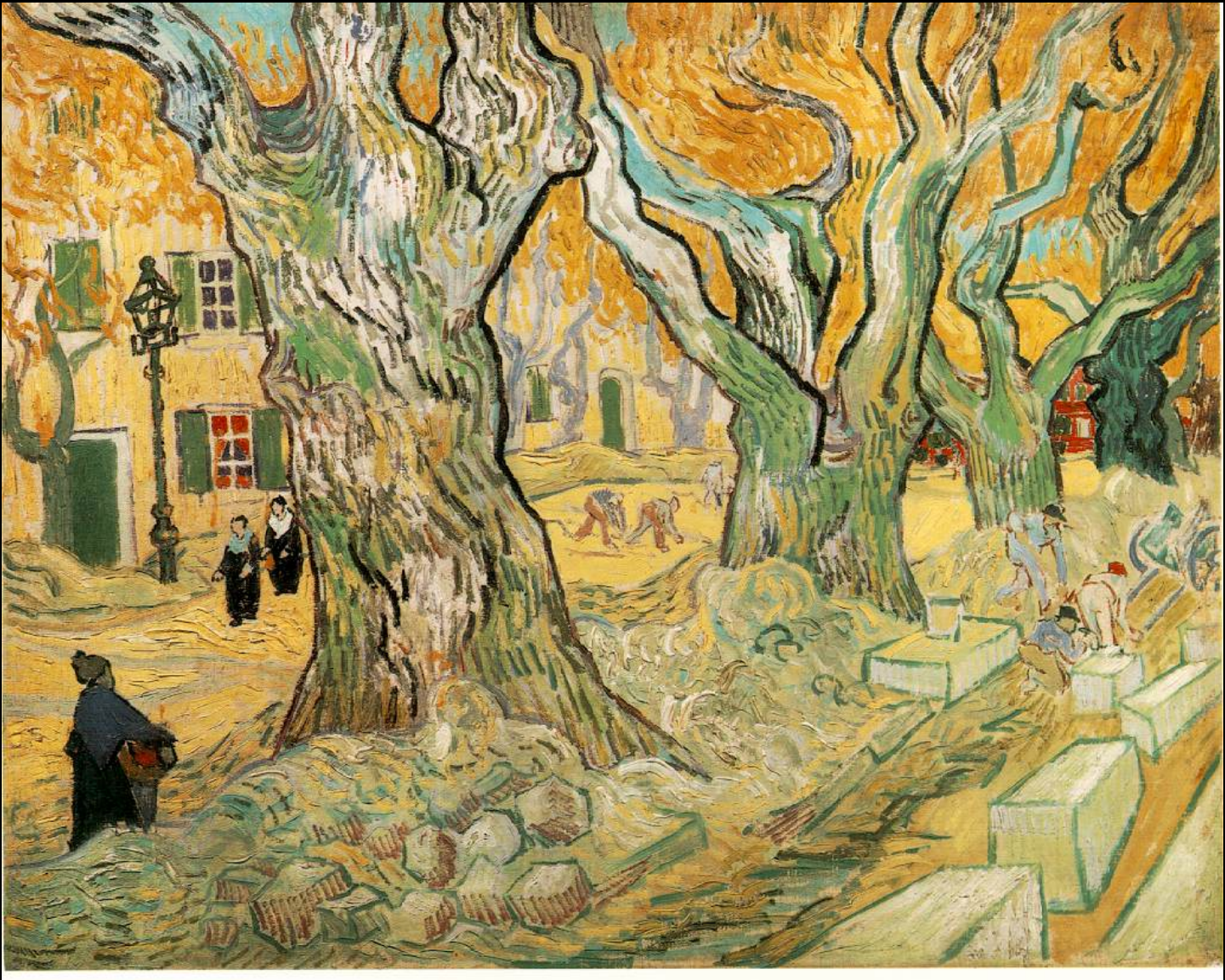
THE ROAD MENDERS (1889)