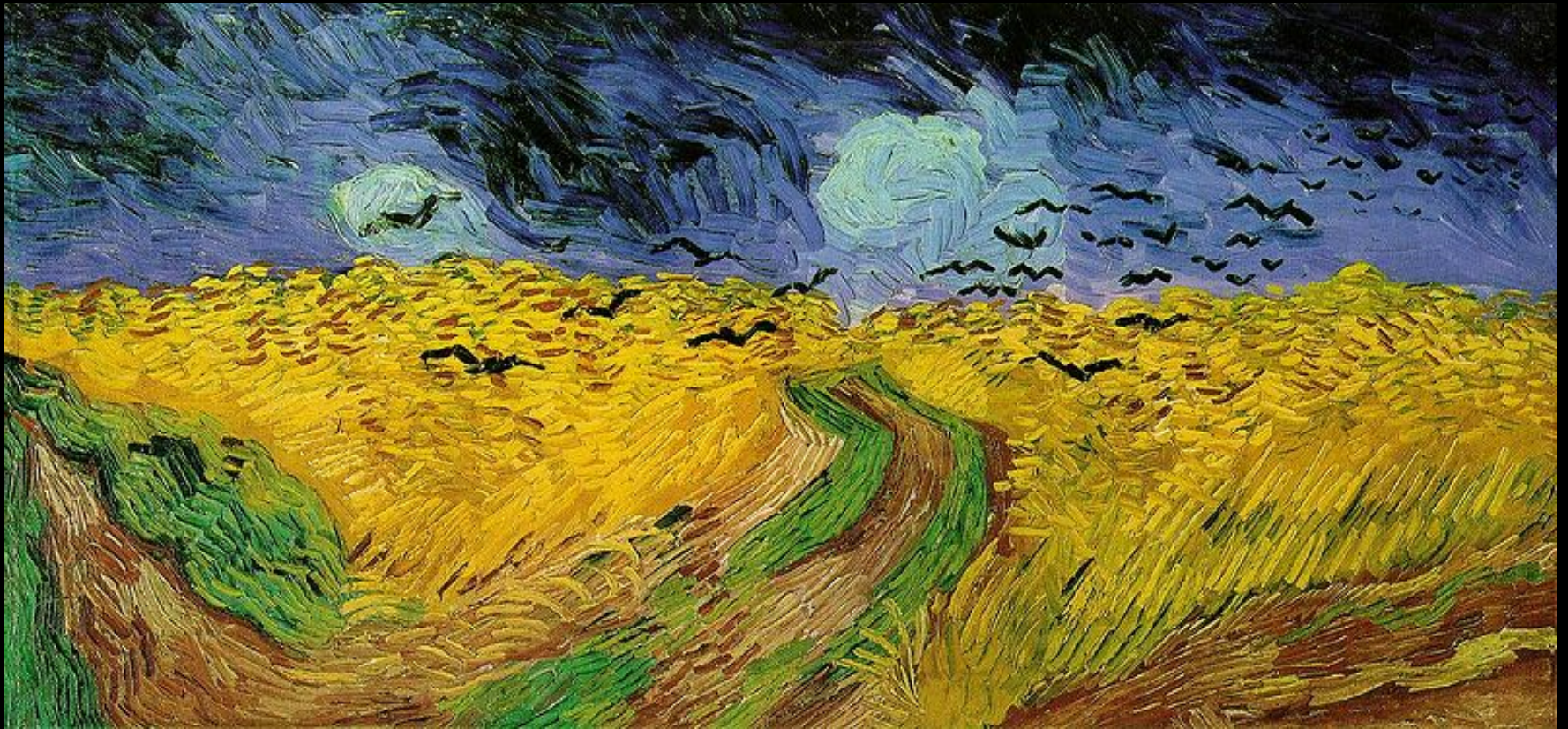
WHEAT FIELD WITH CROWS (1890)