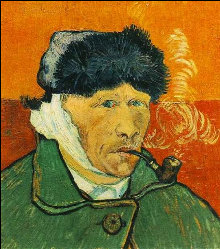
SELF PORTRAIT (1889)

NEVER FAMOUS OR SUCCESSFUL IN LIFE, BUT MUCH ADMIRER BY OTHER ARTISTS