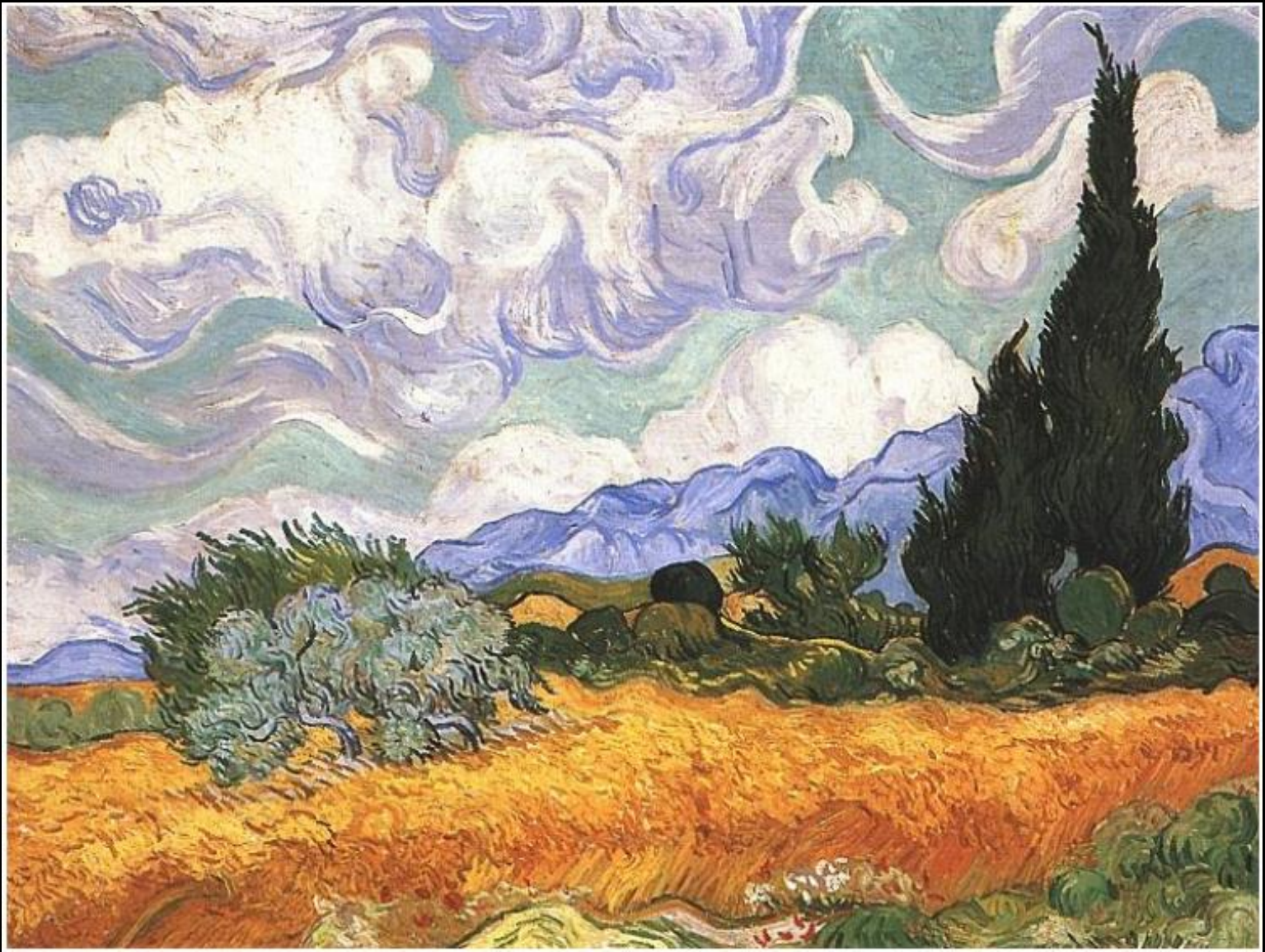
WHEAT FIELD WITH CYPRESSES (1889)