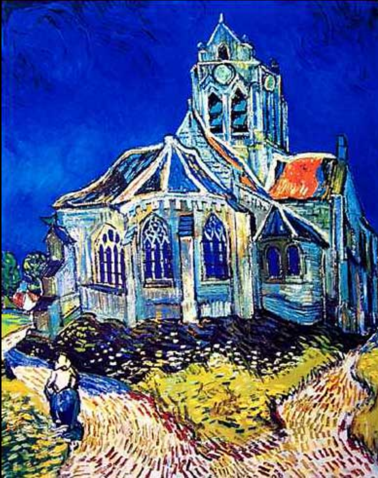
THE CHURCH AT AUVERS (1890)

INFLUENCED BY IMPRESSIONISTS AND POINTILLISTS HE MEETS