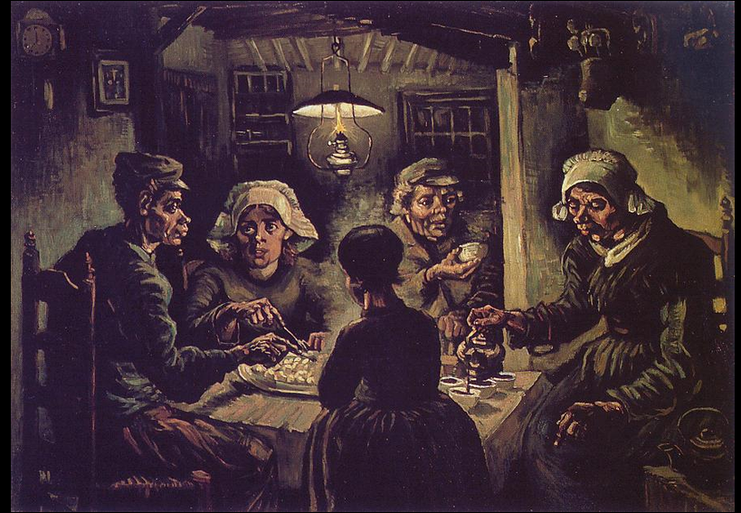
THE POTATO EATERS 1885

TAKES CARE OF HIMSELF POORLY-SPENDS ALL HIS MONEY ON PAINT AND MODELS